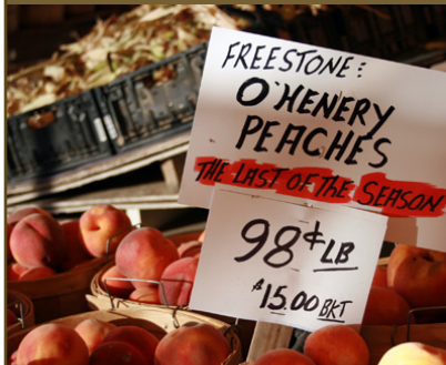
Fresh Peaches at Fruitway Market - Utah