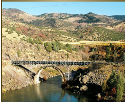
Last Chance Dam - Grace, Idaho

1 - Box C Ranch Working cattle ranch you can participate in cattle drives, roping and branding, horseback riding and training colts. Situated in the northwest corner of Utah on Grouse Creek Road, 4 miles north of the Grouse Creek store. 866.779.2105, www.boxcranch.com