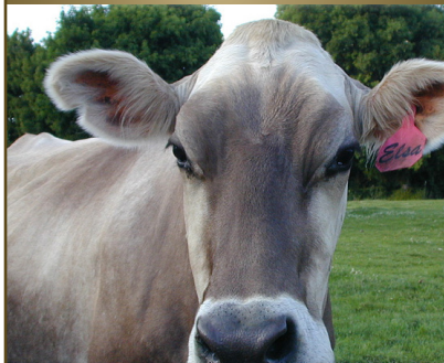
Elsa at Rockhill Creamery - Richmond, Utah